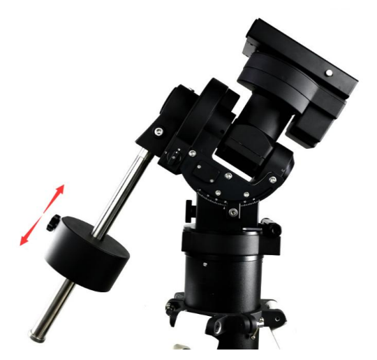
You may need more CW for heavier payloads, or a smaller CW for lighter scopes.

5. Install counterweight(s): Before putting on CW, make sure the mount is at its zero position, i.e., CW shaft points to the ground. Disengage the R.A. Gear Switch to set the R.A. axis free before loading the CW. Remove the CW Safety Cap at the end of CW Shaft. Glide the CW over the shaft with the larger hole opening facing down. Place the Safety Cap back onto the shaft. Move the CW to the bottom of the shaft and tighten the CW locking Screw.